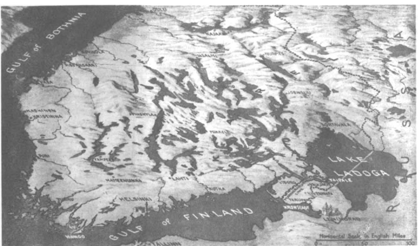
This map shows the physical features of the southern half of Finland, and In particular shows how truly It Is called the Land of the Thousand Lakes. The central plateau of the country has an elevation of from 300 to 500 ft. Off the southern coast are many islands of widely differing sizes. Both the rivers and lakes are frozen from December to May.

Specially drawn for The War Illustrated by Felix Gardon