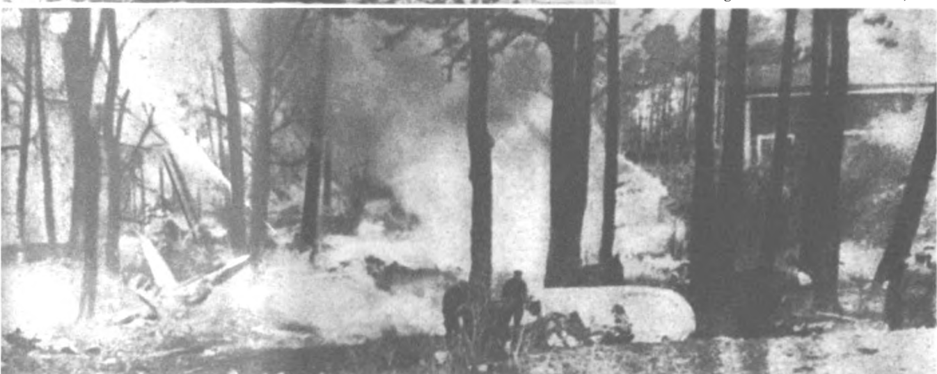
In the first two days of war Helsinki suffered heavily from attacks by Russian bombers, but the Finnish anti-aircraft fire was so steady and accurate that the raiders soon desisted. At a conservative estimate they were said to have lost forty aircraft either from anti-aircraft fire or from the activities of the Finnish fighter planes. Some of the Russian casualties are illustrated in this page; all the photographs are of Russian bombers brought down in flames in or near Helsinki. Finland's first line air force numbered only 230 warplanes in peacetime, but those included Fokkers, and British Blenheims and Gladiators.