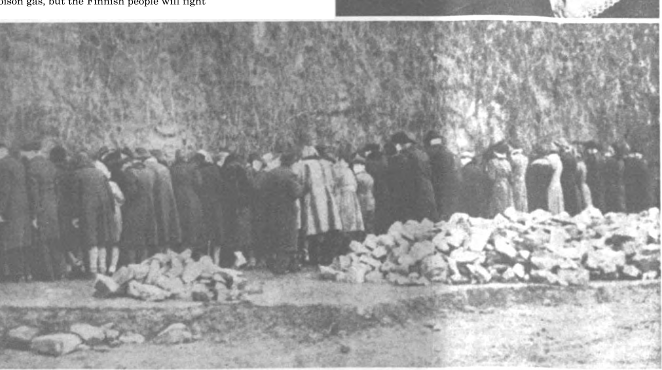
The Russian pretence that they were not making war against women and children is shown to be yet another "Red" lie by the photographs In this page. In that immediately above, people of Helsinki, chiefly women, are seeking some sort of protection from the bombs by standing close to a creeper-clad wall. The position they have taken up Is probably as safe as any that could be found in the open. Russian airwomen were stated to have taken part in the bombing of the women and children of Helsinki.

The baby seen top right is being carried into an air raid shelter during one of the Russian raids on Helsinki, while above, children are huddled together as bombs explode outside. Right, is a typical Finnish woman with children evacuated from Helsinki.